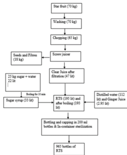
Figure 3. Mass flow chart for RTS beverage preparation from fresh sugar syrup