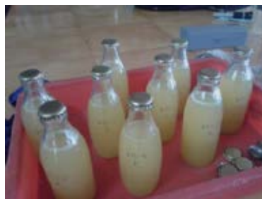
Figure 2. Prepared RTS beverage

The fruits were subjected to proper unit operations for extraction of fresh juice [12]. The cleaned star fruits were chopped into small pieces followed by the juice extraction by a screw type juice extractor. The extracted juice was strained through a double layer muslin cloth to obtain the clarified juice devoid of seeds and fiber particles. In a separate container, sugar syrup was prepared by mixing commercially available sugar so as to provide adequate textural property to the juice. Then RTS was prepared by mixing sugar syrup and fresh star fruit juice at required proportions (Figure 2). The final TSS (Total Soluble Solids) and juice percentage were maintained as per the FPO specification. For flavoring, the RTS was mixed with ginger juice at an amount of 15-16 mL per liter of RTS. Sterilized glass bottles of 200 mL capacity were filled with RTS and sealed by a crown cork sealing machine followed by re-sterilization for 20 min. The mass flow chart for the RTS beverage prepared from the fresh sugar syrup is given in Figure 3.