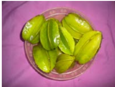
Figure 1. Whole star fruit

Star fruits “golden star variety” samples at proper maturity were procured from the Orissa University of Agriculture and Technology premises, Bhubaneswar during the month of January for relevant experimentations. The maturity stage was decided on the basis of their color and textural property [11]. The collected whole fresh fruits (Figure 1) were properly washed in the running water to remove dirt and foreign particles; surface moisture was wiped with a clean towel.