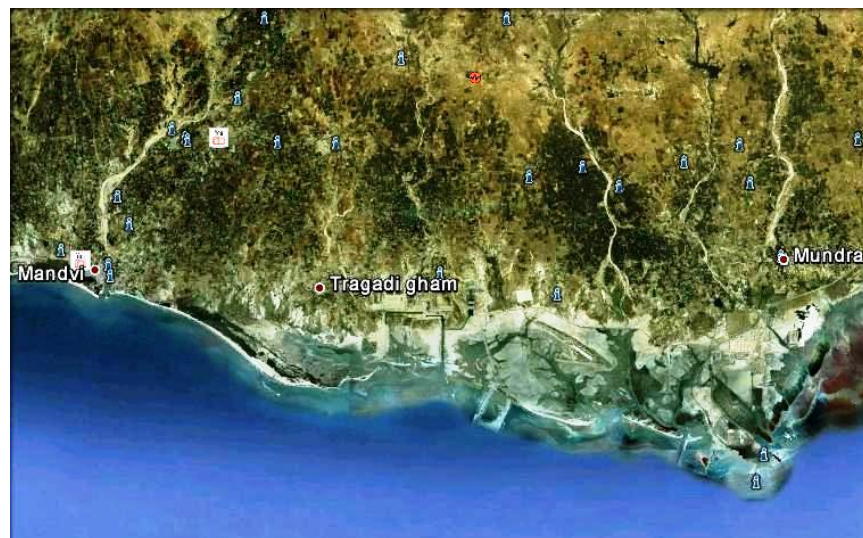
Figure 3. Sketch map showing lineament and structural control on the development of coast on Mandvi to Mundra Segment (modified after Google Earth).