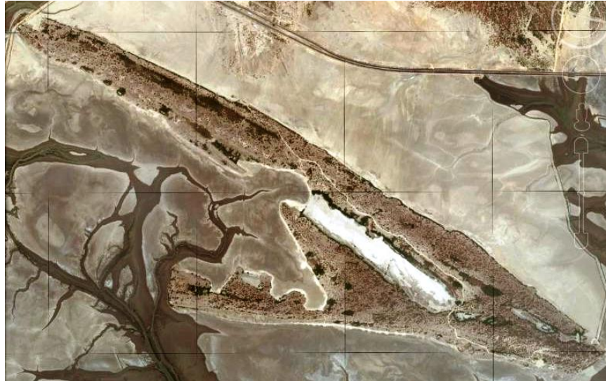
Figure 2. Phases of development of Mundra dune along Navinal coast in Mandvi-Mundra segment.

parallel dunal ridges. Length of the recent beach with raised beach is ~7 km. The lagoon in between first and second phase of beach-dune complex must have been filled later on to give rise to tidal flats. All such characters are indicative of continual upheaval of the coast since last 2000 years. Exact dates of different phases of upheaval are required for in depth study.