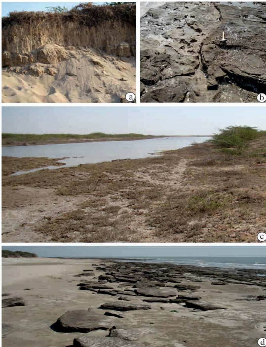
Plate 3. Mandvi to Mundra segment (a). Raised beach. (b). Displacement along fractures at Modava spit showing tectonic activity. (c). Tidal creek behind Modava Spit. (d). Exposures of hard rock (wave cut platform) and tidal flat at Modava spit.

It also appears to have influenced the broad morphological pattern on both its sides including coast, acting as a hinge zone and uplifting the eastern part of the basin and simultaneously down tilting the western part [1][2].