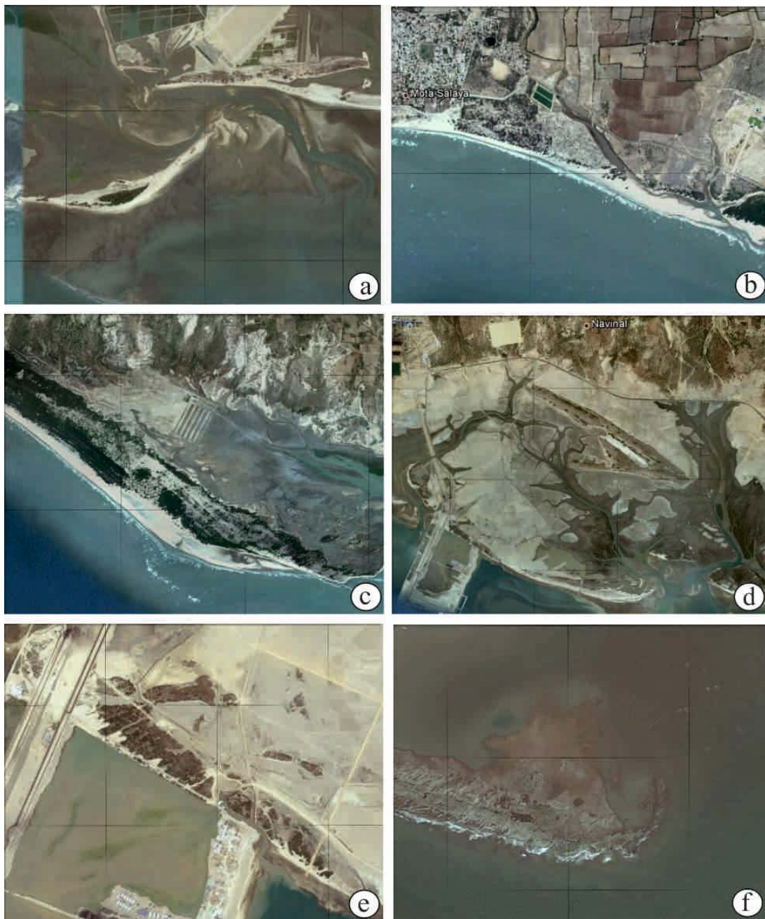
Plate 1. Mandvi to Mundra segment (a). Barrier islands and saltpan. (b). Beach, dune, creek, tidal flat and ridge-runnel on beach. (c). Modava spit, beach-ridge-runnel, raised beach, sand dunes, tidal flats, creeks, saltpan and guard-rock exposures on tip. (d). Mundra dune, Kodaki and Bharadimata creeks, tidal flats, hooked barrier, bar, Phot delta on Navinal coast. (e). Parabolic dunes, New Mundra Port and tidal flats. (f). Rocky exposure and origin of spit-bar-barrier. (Modified after Google Earth).

According to [1] the pattern was produced by primordial fault pattern in the Pre-Cambrian basement. Major uplifts took place several times since then, especially along a series of first order E-W lineaments and have led to differential movements of discrete basement blocks and consequent drape-folding of the blanketing sediments, while some of the folds are attributable to syn-tectonic plutonic intrusions [1]. In the Kachchh mainland, bordering the Arabian Sea consists mostly of hill ranges, uplands and shallow colluvial plains. Unidirectional movements since the late Cretaceous have not only resulted in a youthful