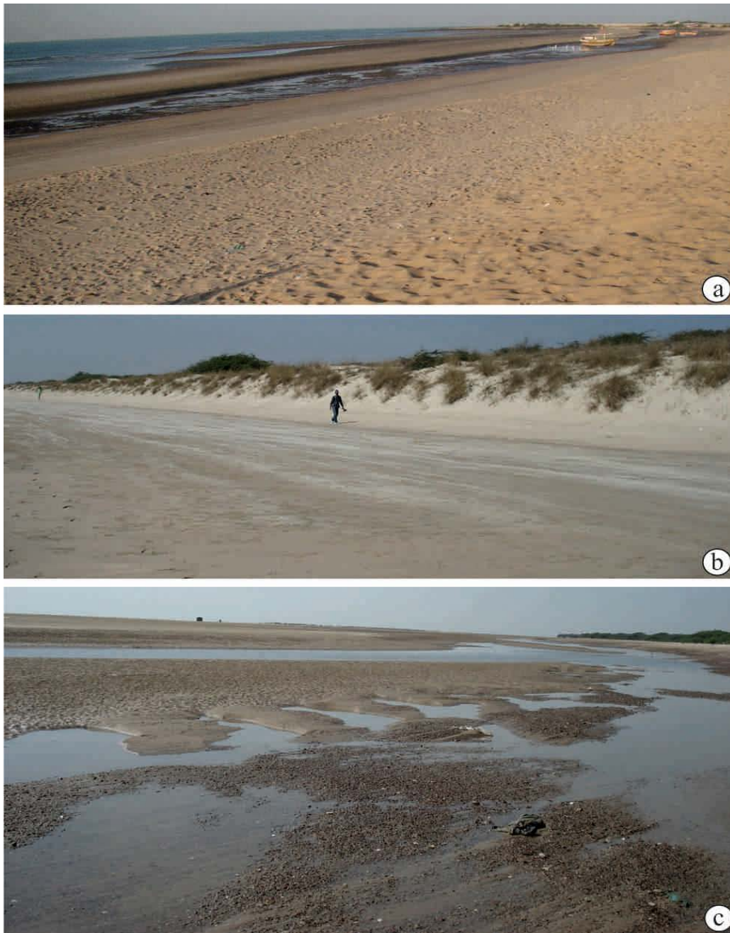
Plate 2. Mandvi to Mundra segment (a). Ridge and runnel system. (b). Coastal dunes and tidal flat. (c). Beach, ridge-runnel with antidunes.

topography, but also accentuated the structural pattern. Each uplifted segment is generally bounded by a fault or sharp monoclinical flexures along its northern edge at a gentle dip slope in the south, creating in the process typical cuesta topography. Movements along N-S structural high in the basement that cut across the E-W structural trend and is called median high considerably influenced the structure, facies and sediment thickness to the east and west of it [4], which also influences coastal geomorphology much more and inscribed its signature on coastal features.